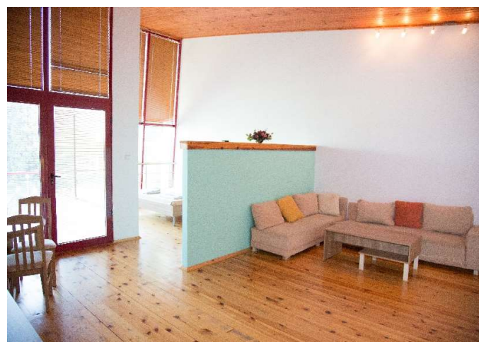
About Sozopol - MoD** Hotel:

Sozopol-MoD Hotel** consists of two buildings – main and adjacent. The property has 29 apartments (suitable for accommodating families with one or more children) and 54 double/twin and triple rooms.